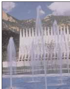
Chapel photo courtesy of Colorado Springs Convention and Visitors Bureau

• Legendary Hollywood director, Cecil B. DeMille, designed the cadet parade uniform which is still worn by cadets today.